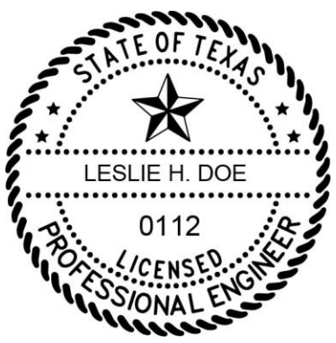
Figure: 22 TAC §137.31(c)